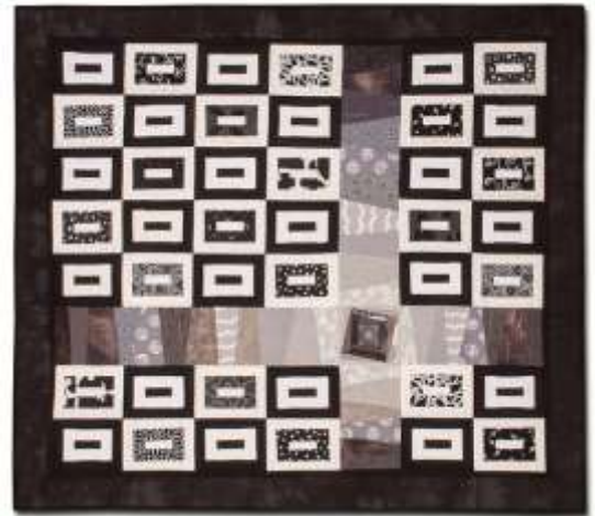
IDENTITY: Black and White and Gray

I was touched that so many friends and family from Winnipeg and people attending the lecture came to the Opening Reception. Creating the exhibit ' Feeling from Without and Within ' was truly an illuminating and unforgettable experience for me.