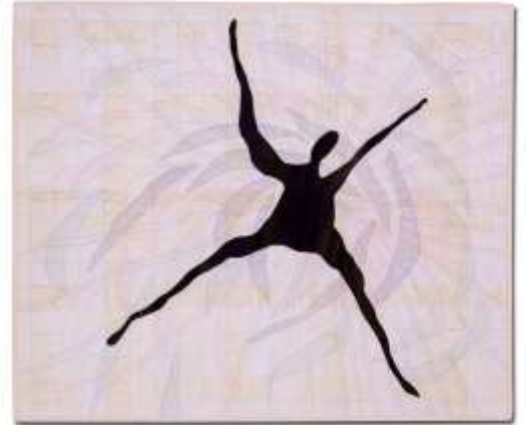
FAITH: Freefall or Flight

I told my story, showed images of the exhibit, read the artist statement for each piece and made additional comments. The response was great – almost everyone had a similar type of story about a family member or loved one. The discussion afterwards was an amazing time of sharing and community.