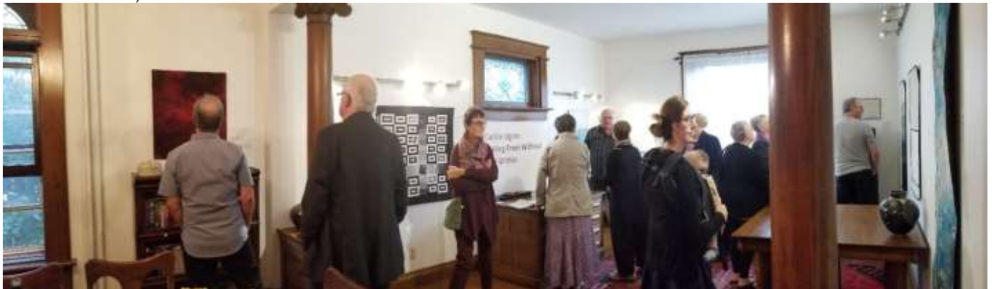
12 th Street Gallery

12 th Street Gallery/ B&B 307 12 th Street, Brandon Friday, February 8 from 7 – 9 pm