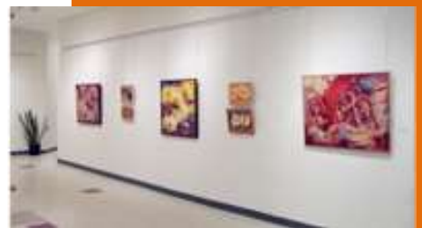
PDAC Gallery space is open and inviting!

As a member of the Grand National Committee and a past exhibitor at the Grand Nationals I encourage every TFAM member to submit a call for entry into the 2019 exhibit entitled 'Still' .