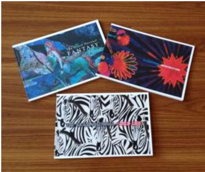
Previous catalogues from the Grand National Quilt Exhibit

The Grand National Quilt Show was inaugurated in 2003 as a competition to encourage and showcase the work of both traditional and innovative Canadian quilters and fibre artists. It was sadly announced that the 2017 show held in Kitchener-Waterloo was to be the last.