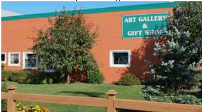
Portage and District Art Centre

For the last year and a half, a group of Canadian fibre/quilt artists have worked to make a commitment to carry on the tradition of The Grand National Quilt Show. The show will now be called The Grand National Fibre Art & Quilt Exhibition to open up the competition to other forms of fibre art while still maintaining a strong component of quilt art. Our committee has secured a commitment from the Portage and District Arts Centre in Portage la Prairie, Manitoba to host the event from July 6 – Aug 10, 2019 and have set the theme, ' Still ', a play on words that represents the fact that the Grand National 'Still' exists but also gives the artist considerable leeway in creating their art work.