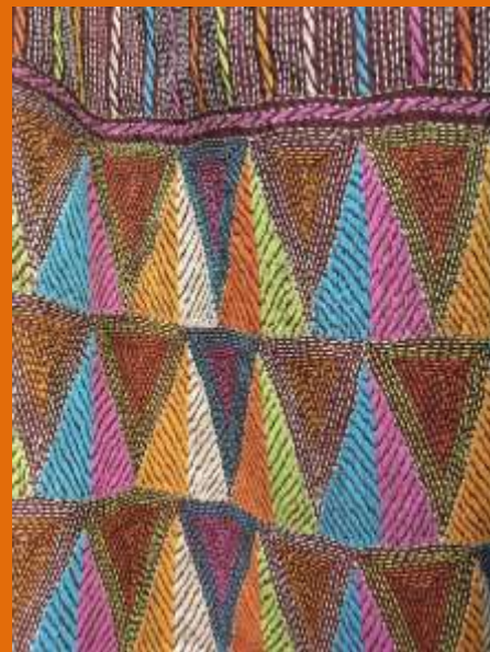
Examples of intricate kantha stitch work

My visit to India was a fascinating journey to the source of many iconic Indian products, and an eye-opening look at individuals and families, who live in the most basic and rustic of environments, creating such beautiful objects. The people we met were so warm and welcoming and eager to share their work with us. It was heartening to know that there are cooperatives and NGOs working to preserve and protect traditional craft in India and to ensure fair pay for artisans. I came home with many scarves and stoles and pieces of fabric