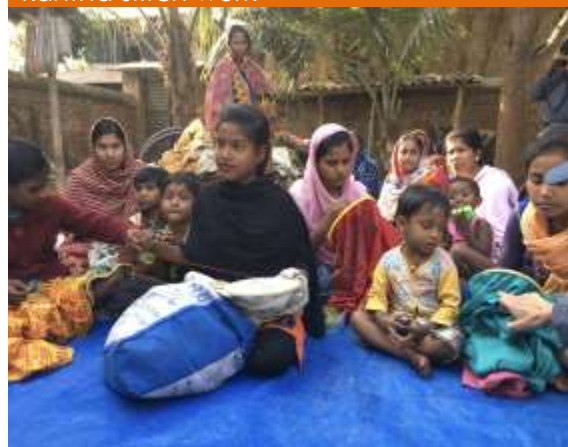
Visit with women and girls with their kantha stitch work