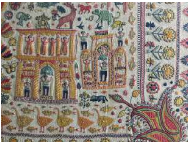
100 year old kantha stitched panel on display at the Victoria Memorial in Kolkata.

Back in Kolkata, we spent a day visiting the Gloster Jute Mill, a large industrial complex that has been in business for 80 years. Their products are sold all over the world. This was definitely the opposite end of the fibre spectrum. We also had a chance to visit the Craft Resource Center, an organization that works with about 5000 artisans to help them preserve and develop their creative skills, earn fair wages and find export markets for their work. Ten Thousand Villages is one of their major partners.