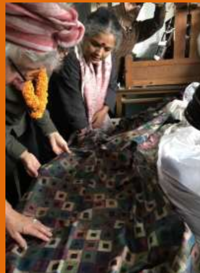
Admiring kantha stitching at Rangeen

One of the many highlights of the trip was our visit to Shantiniketan, the home of Visva-Bharati University, founded by the Nobel prize winning poet, Rabindranath Tagore. In addition to touring the campus and the Tagore museum, we visited the Amar Kutir Society for Rural Development, a collective tasked with rejuvenating traditional rural crafts and supporting the development of new craft opportunities for local people. Here we followed the processes of making leather goods and batik