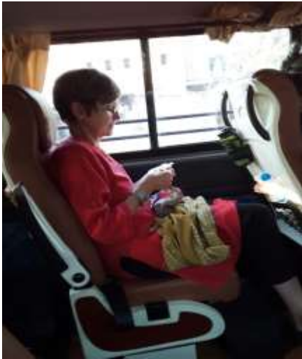
Finding time to stitch