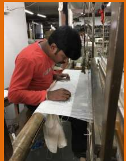
Weaver at Rangeen weaving intricate jamdani pattern, a layer added atop the regular weaving.