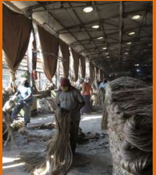
Visit to Gloster Jute Mill, a large commercial jute manufacturer in Kolkata.