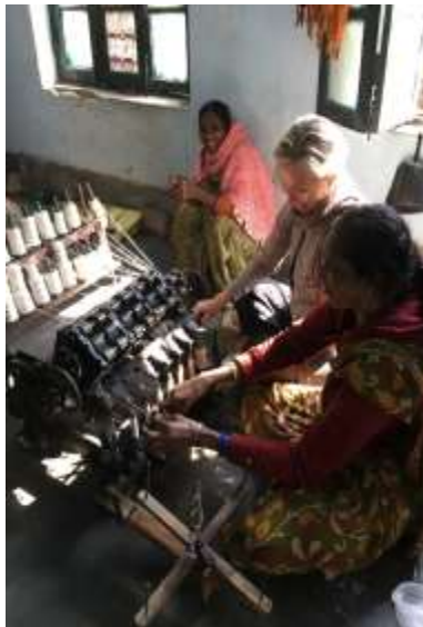
Extracting silk thread From cocoons

In the Murshidabad and Berhampore region, we visited a workshop complex where silk is manually extracted from silkworm cocoons. The work is done in a very hot and toxic environment and each workday begins as early as 4 am to avoid the heat of the day. The workers spend eight hours a day with their hands in scalding hot water that loosens the silk from the cocoon. We also had a chance to learn how to spin thread on to spools with a group of lively and very welcoming women.