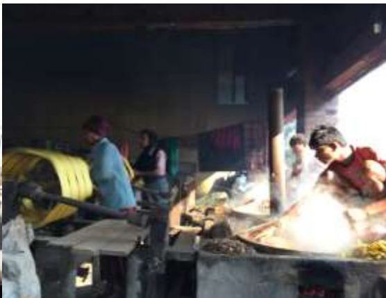
Learning how to wind cotton thread bobbins

One of the many highlights of the trip was our visit to Shantiniketan, the home of Visva-Bharati University, founded by the Nobel prize winning poet, Rabindranath Tagore. In addition to touring the campus and the Tagore museum, we visited the Amar Kutir Society for Rural Development, a collective tasked with rejuvenating traditional rural crafts and supporting the development of new craft opportunities for local people. Here we followed the processes of making leather goods and batik